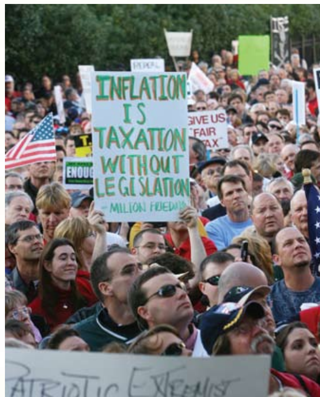
A crowd of about 15,000 at the Atlanta Tea Party on April 15 protested against an out-of-control federal government and its bailouts, high taxes, deficit spending, and inflation.

In this environment, simply amending the Constitution would not be sufficient to get the government back under control. However, there are numerous individuals and groups that still advocate constitutional amendments as the solution.